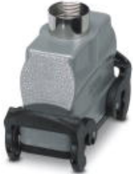
HEAVYCON B16 coupling housing, with double locking latch, height: 70.5 mm, with 1 x Pg21 gland, straight cable outlet

Please be informed that the data shown in this PDF Document is generated from our Online Catalog. Please find the complete data in the user's documentation. Our General Terms of Use for Downloads are valid ( http://phoenixcontact.com/download )